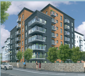
Image is indicative only