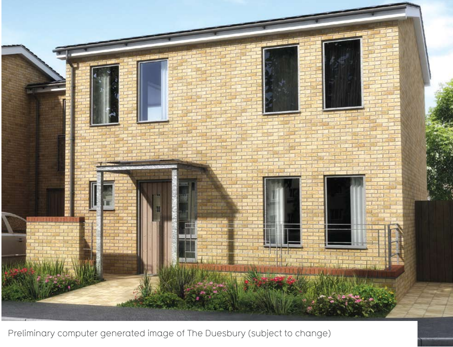
Preliminary computer generated image of The Duesbury (subject to change)